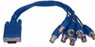
9-16 Cams Video Cable