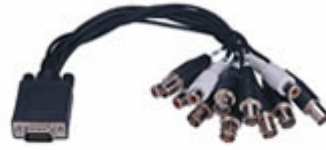
1-8 Cams Video/Audio Cable